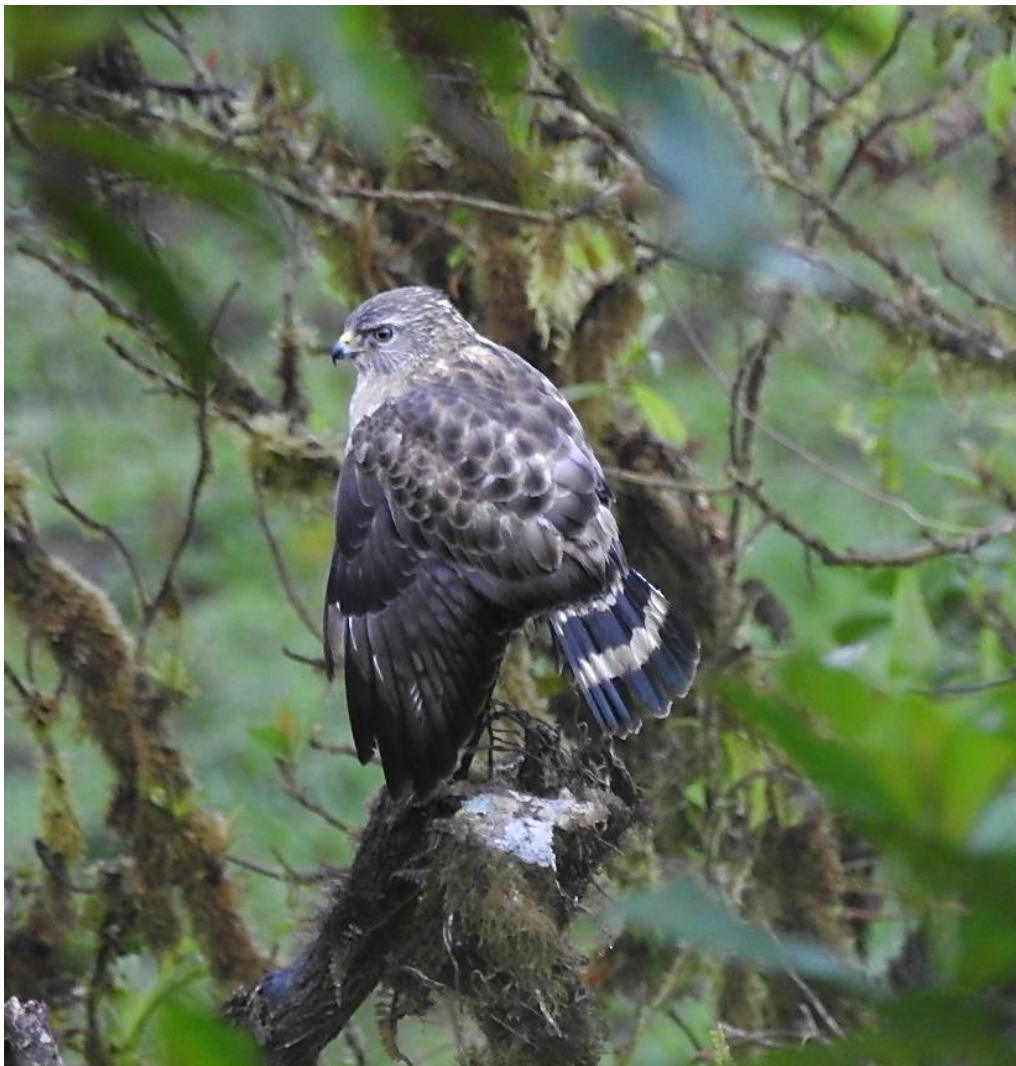
One of our (at least) three overwintering individuals of Broad-winged Hawk heard and seen at all elevations at RLG.

The normal pattern at Reserva Las Gralarias (RLG) is that by mid-February/early March the altitudinal migratory birds have returned to nest while the northern neotropical migrants such as Blackburnian Warbler, Swainson's Thrush and Broad-winged Hawk are still vacationing on the reserve. We now know that we have three individual Broad-winged Hawks overwintering at RLG plus, as a recent birder said, 'very many' Blackburnians now in their prime, brilliant, breeding season plumage. Unfortunately, the numbers of neotropical migrant passerines seen have declined significantly over the years in our entire area, so we assume that is due to low breeding success of migrant passerines in their summer breeding habitat.