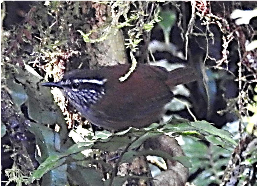
Adult Gray-breasted Wood-Wren in our garden

parents immense cause for concern as they chatter loudly to collect their young back together and quickly disappear into the undergrowth.