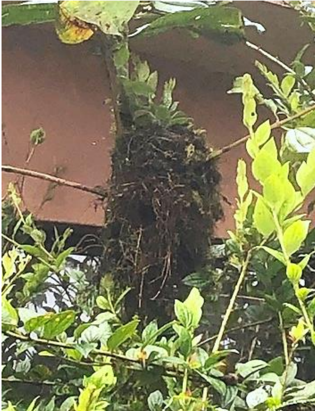
A completed nest of a clan of Sepia-brown Wren. The nest chamber entry hole is visible.