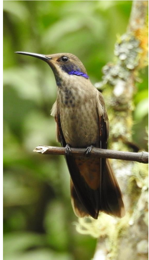
Right: Brown Violetear