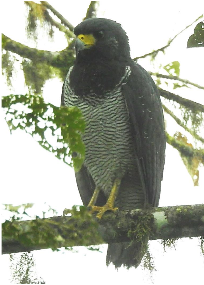
Left: Barred Hawk

I always wonder why the breeding season migrants show up in the first half of February since it is still very wintry, and spring seems a long time away. But by early March our three species of migrant hummingbirds - the Lesser Violetear being first to arrive around 10 February, then by the end of March, the Brown and Sparkling Violetears, as well as Crested Quetzal arriving - all can claim they were correct as March does in fact bring us springtime. It begins, then ends, then begins again, then ends again...then slowly we note sunny warm mornings and less rainfall. We begin to see lizards and butterflies sunning, birds soaring and swifts twittering overhead.